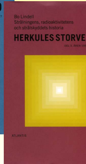
The Labour of Hercules