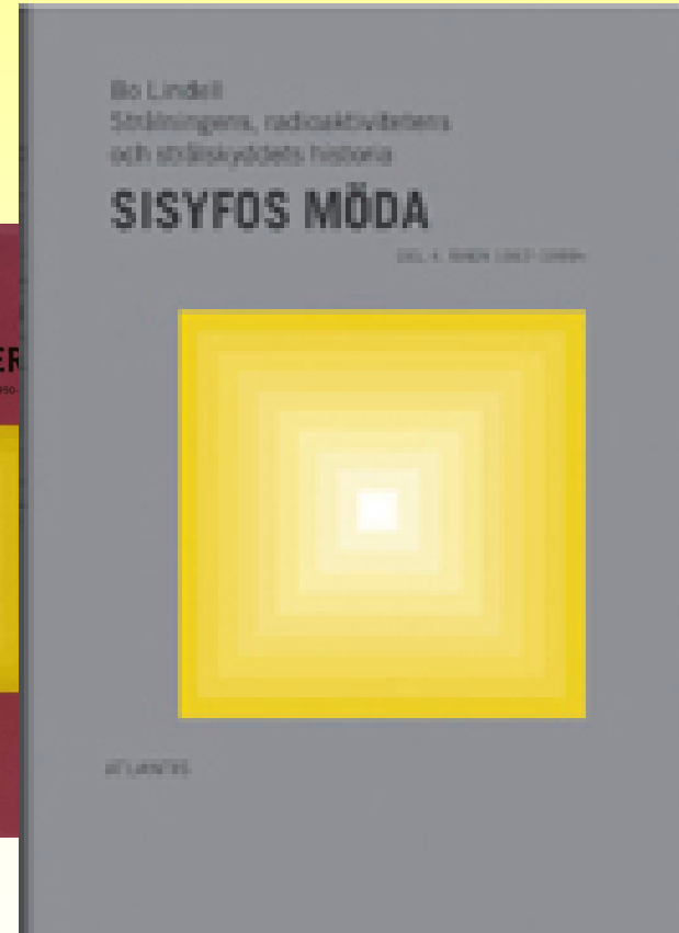
The Pains of Sisyphus